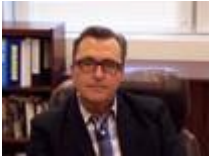
From the Executive Director