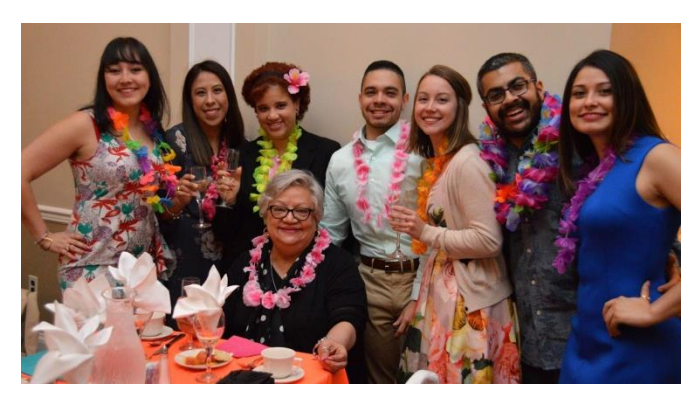
And of course thanks to our sponsors of this year's WOW! Awards Gala